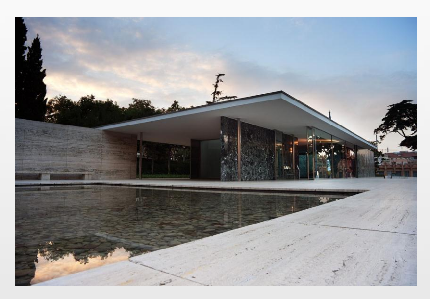
Exposed spaces of Barcelona pavilion