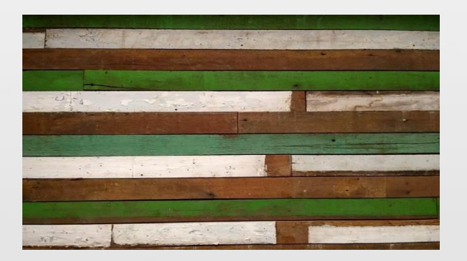
WOOD is sturdy and flexible

https://commons.wikimedia.org/wiki/Fil e:Concrete texture.jpg