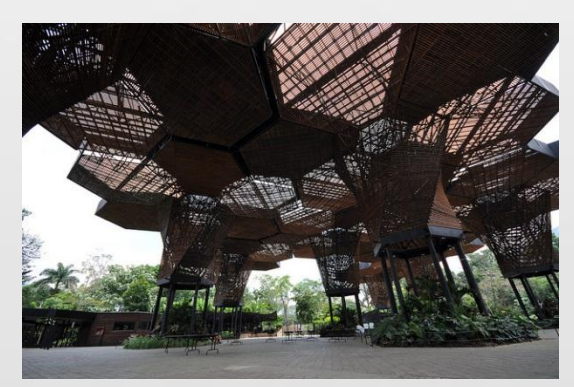
Orchidarium - Medellin Botanical Garden

https://en.wikipedia.org/wiki/Earth house - /media/File:Dietikon - L%C3%A4ttenstrasse Erdhaus Peter Vetsch IMG 6126.JPG