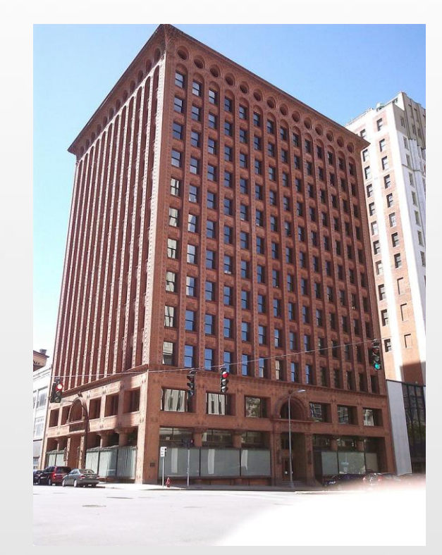
The Wainwright Building (1890)

https://en.wikipedia.org/wiki/Prudential %28Guaranty%29 Building - /media/File:Prudential Building 2013-09-08 12-21-41.jpg