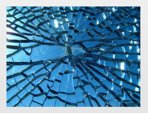
GLASS is transparent and allows light to filter in.

https://pixabay.com/en/wood-color-texturegreen-wooden-846258/