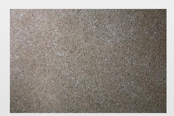
CONCRETE is fluid

https://commons.wikimedia.org/wiki/Fil e:Concrete texture.jpg